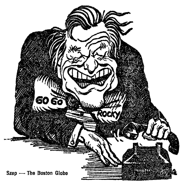
ROCKEFELLER: WAITING FOR THE CALL.