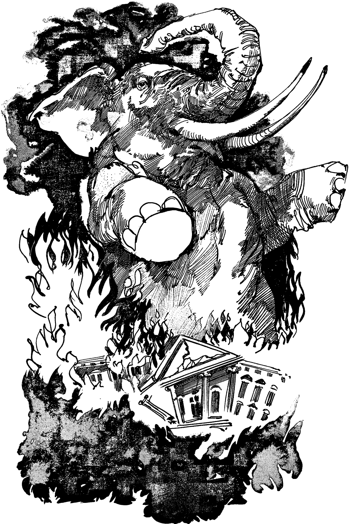
"The Emerging Republican Problem"