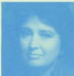
Ann McGill Gorsuch, Administrator, Environmental Protection Agency