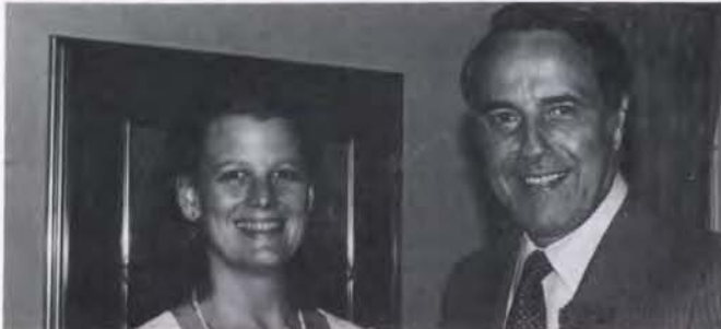
Ripon Society executive director and Republican of the Year honoree Robert Dole gather at the Society's 21st anniversary celebration.