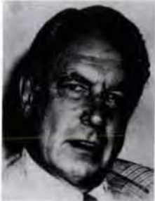
Senator Robert Stafford