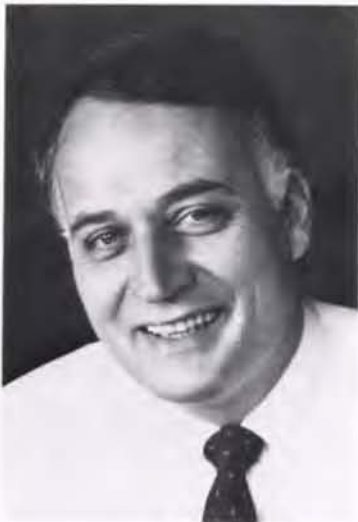
Senator David Durenburger