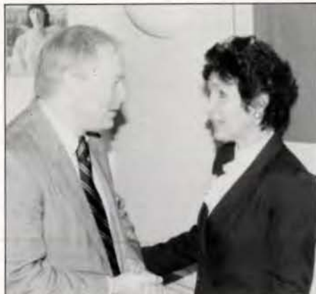
Ripon Society Chairman Jim Leach congratulates Maryland Republican Connie Morella on her election to Congress.