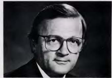
Representative Sherwood Boehlert

Secretary James D. Watkins, condemning the mess he inherited from Ronald Reagan and several caretaker secretaries, says "...years of inattention to changing standards and demands regarding the environment, safety and health are vividly exposed to public examination, almost daily. I am certainly not proud or pleased with what I have seen over my first few months in office."