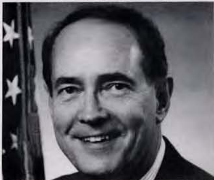
Attorney General Richard Thornburgh