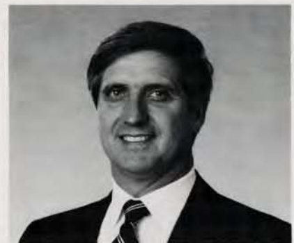
Deputy Chief of Staff Andrew Card (see article page 16)