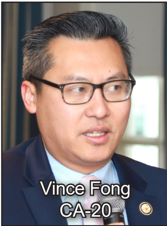
Vince Fong CA-20