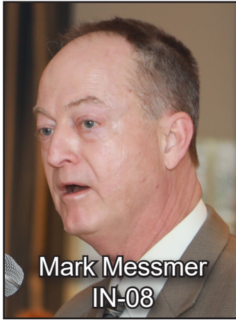
Mark Messmer IN-08